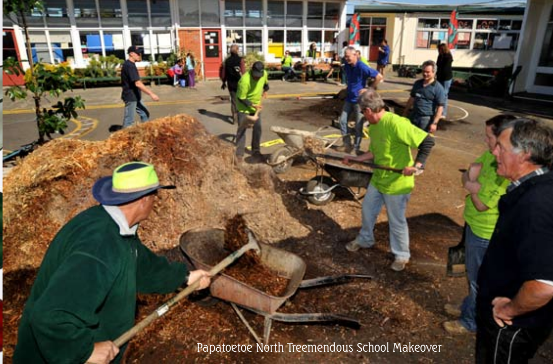
Papatoetoe North Tremendous School Makeover