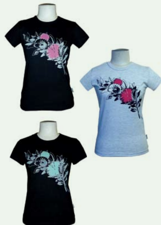
2009 'Bloomer' t-shirts.